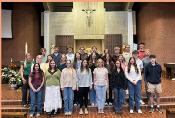
Come, Holy Spirit, fill the hearts of your faithful and enkindle in them the fire of your love. 2026 Holy Rosary Confirmands